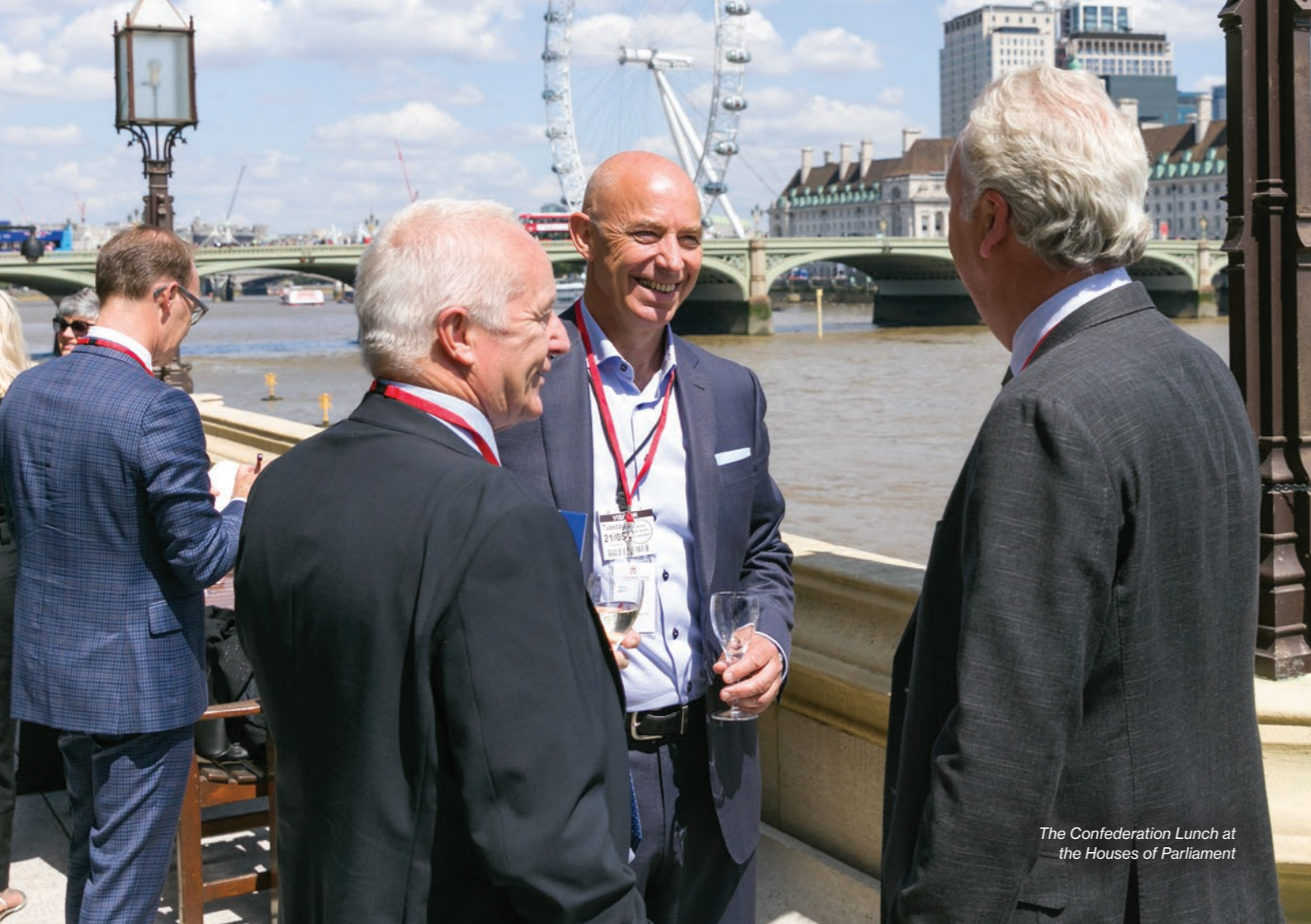
The Confederation Lunch at the Houses of Parliament