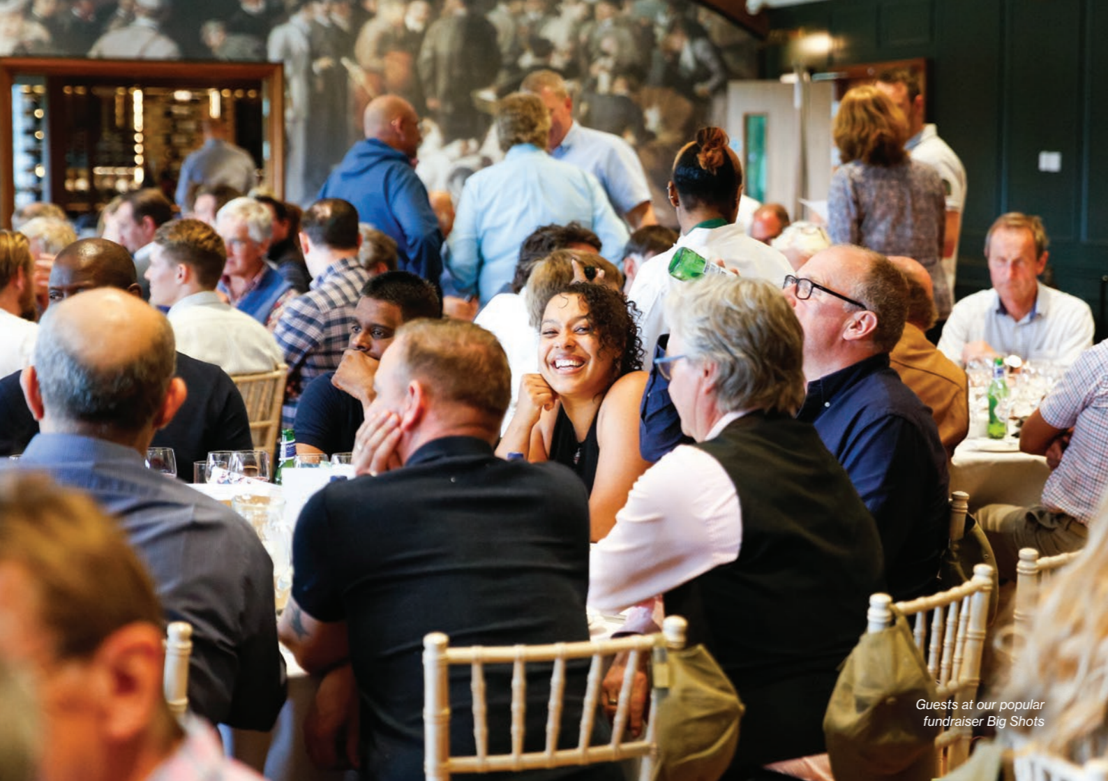
Guests at our popular fundraiser Big Shots