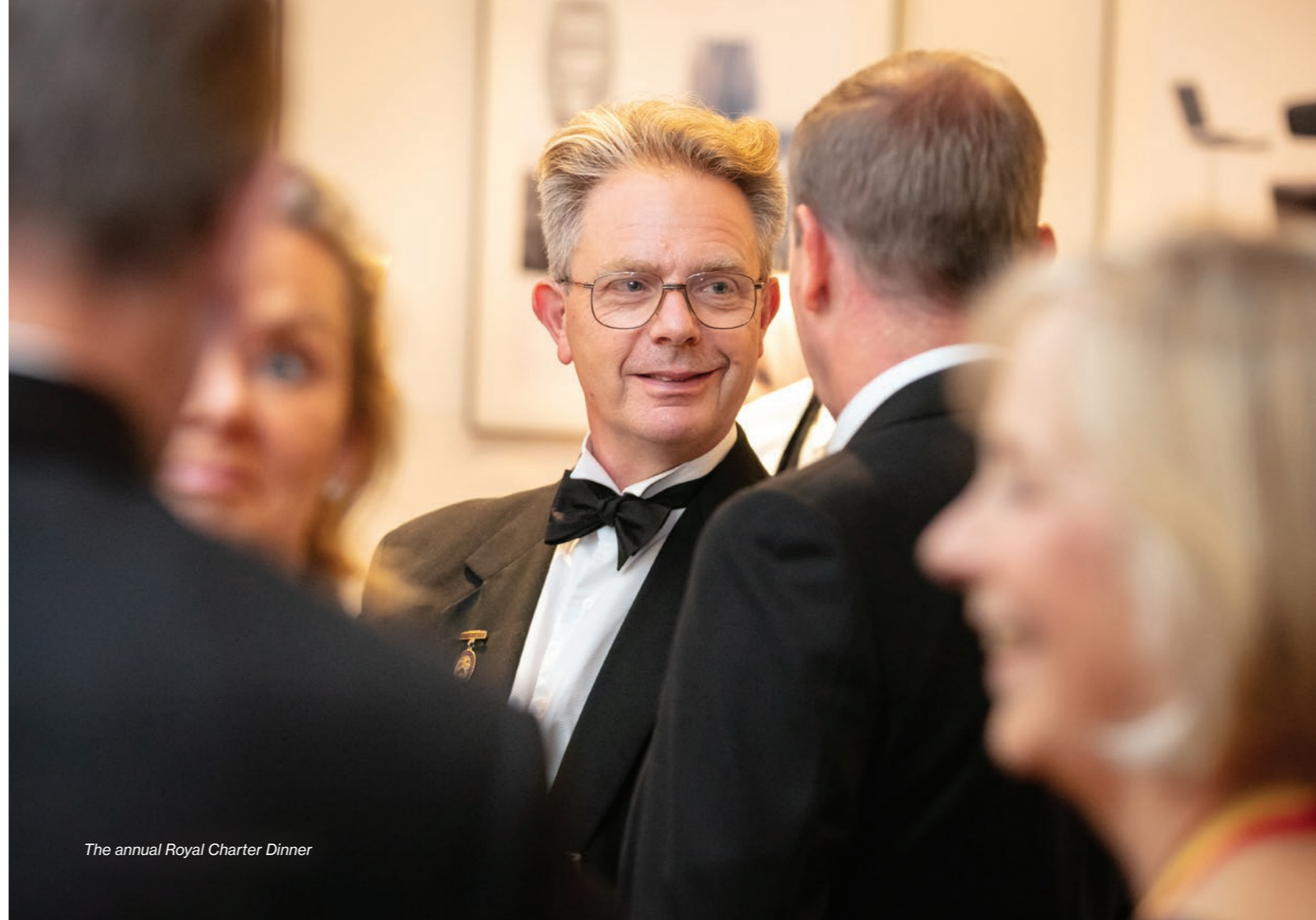
The annual Royal Charter Dinner