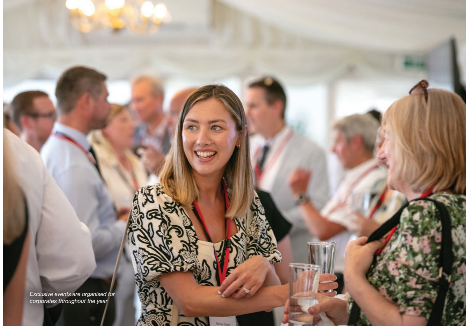
Exclusive events are organised for corporates throughout the year

What our members tend to have in common is a passion for the furnishing industry, a philanthropic desire to 'give back' and a wish to meet and converse with like-minded individuals.