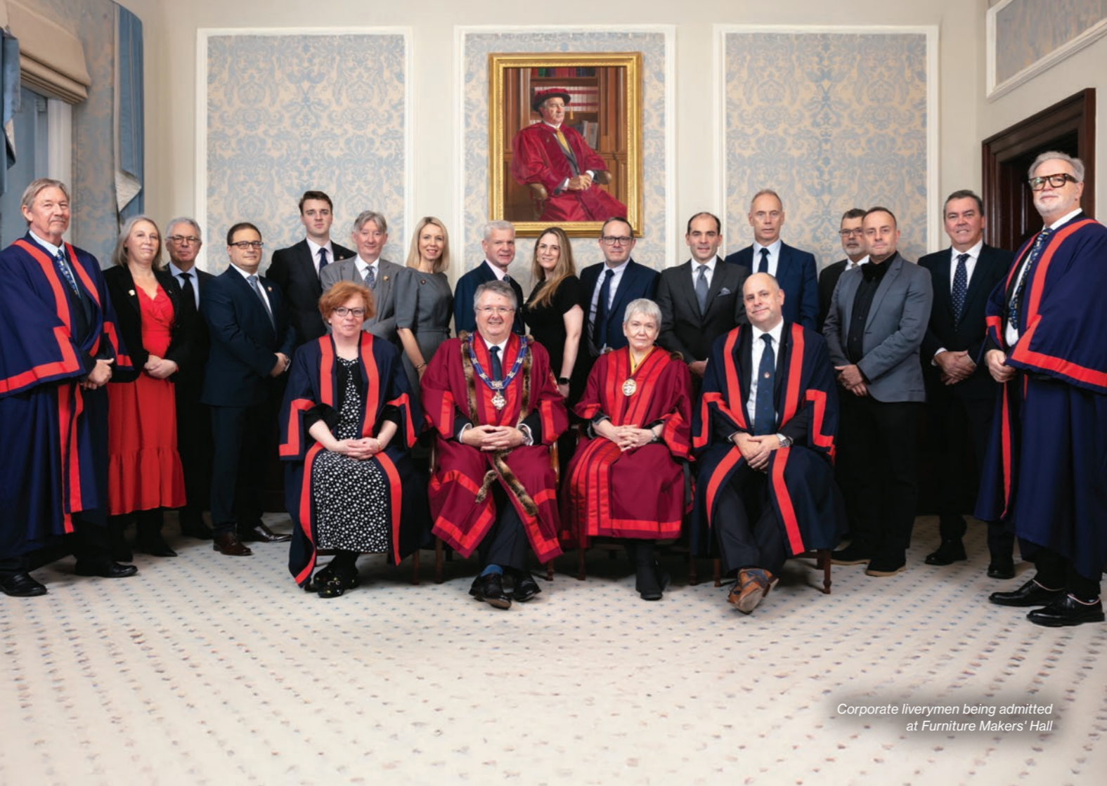
Corporate liverymen being admitted at Furniture Makers' Hall